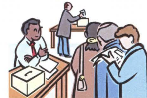
Provisional ballots are handwritten at the polls

Within 30 days after the election, the information as to whether or not your Provisional Ballot was counted and, if not, the reason why, is entered into the free access system set up by the Commissioner of Elections.